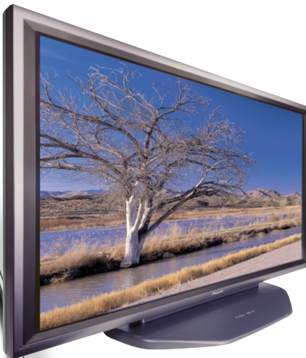
Pictured With Optional Table Top Stand (PDK-5001)

Clean, sharp, high resolution image reproduction for video or computer generated data and graphics